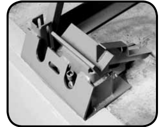
Front SafeTFrame™ Pedestal